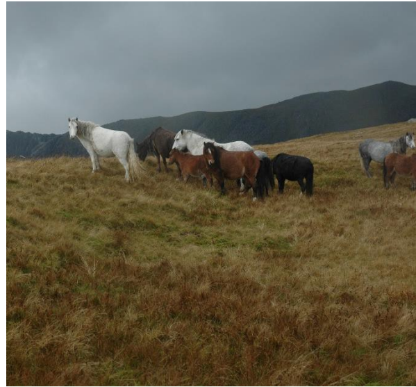
Carneddau ponies

Unfortunately, changing climate, changing land use, invasive species and visitor pressures are impacting on the fragile landscapes and rich biodiversity of the ' ffridd ' and mountain. Traditional knowledge, place names and stories that connect people with the landscape are also at risk of being lost.