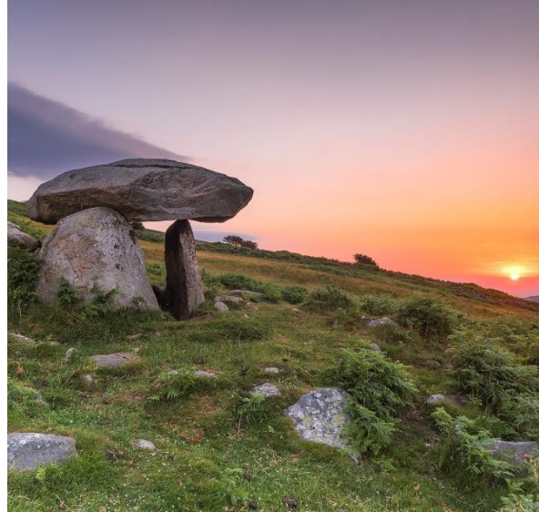
Maen y Bardd Neolithic tomb

In addition to the wide range of planned activities and events, there will be small grants available to the local communities of the Carneddau to support ideas that meet the ambitions of the scheme.