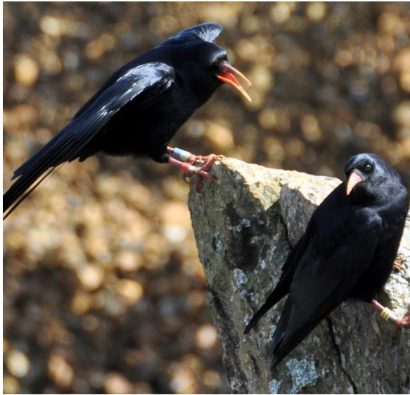
Chough with identification tags

The area is also home to rare and iconic species such as the chough (Welsh: Y Fran Goesgoch , meaning 'red-legged crow'), and the Carneddau ponies – a hardy type of semi-wild ponies, unique to the Carneddau, that roam the open mountain. One of the rarest and most threatened habitats in Wales, montane heath, is found on the summit ridges and mountain tops of the Carneddau and is highly vulnerable to damage by people and animals.