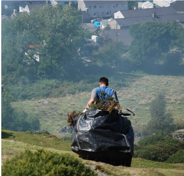
Cutting gorse above Rachub